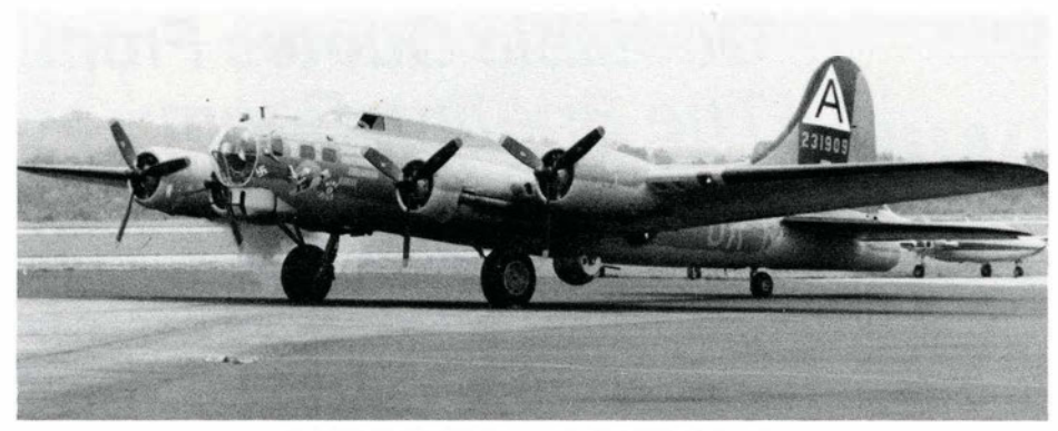
THREE INJURED IN "909" GULLY LANDING